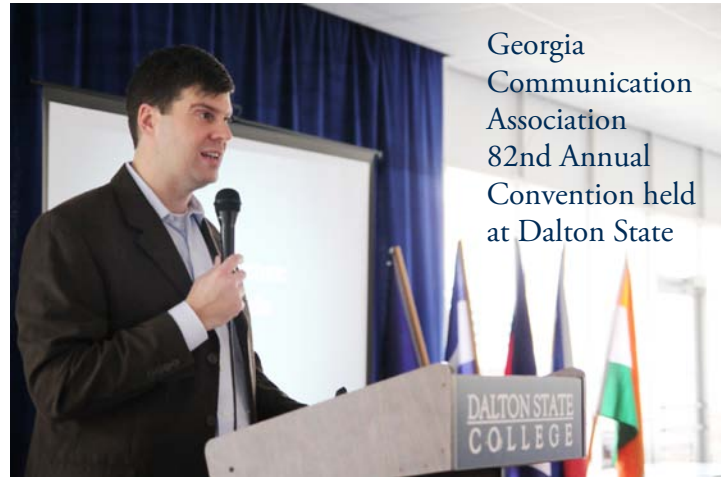
Georgia Communication Association 82nd Annual Convention held at Dalton State